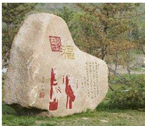
Figure 1 The praying stone monument in front of the temple

The inscription is a collection of historical materials, human landscapes, calligraphy art, and engraved stone art. The ancients left behind the most authentic and solid ancient treasures of future generations. The traditional inscription culture not only involves a wide range, but also a large number. It also carries the development process from ancient times to the present, and it has great cultural, educational and historical value. As a large-scale archive of Chinese stone carvings, the inscriptions are also a wonderful work in the history of thousands of years of civilization in the motherland. Therefore, the inscription culture has become an extremely important part of Chinese traditional culture. Because the inscription also has the characteristics of long-term preservation value, it has taken on extremely important functions in the management of social order in many regions. Moreover, inscriptions are usually recorded in Luqiao Jingdu, school education, The Tongtang clan, temples, etc., as shown in Figure 2. Later generations can infer the basic characteristics of the local social order by examining meritorious monuments, official notices, and township regulations.